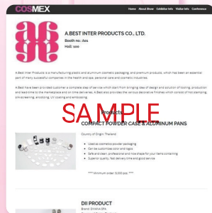
B COMPANY PROFILE