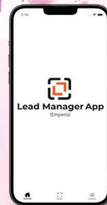
C LEAD MANGER APP